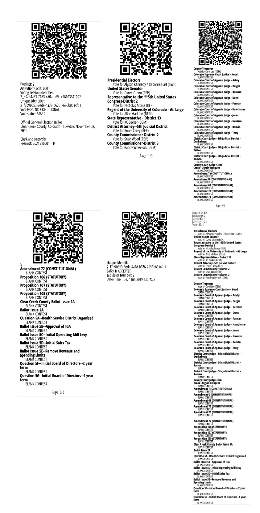
Figure 4-1: Scanned VVPAT audit trail