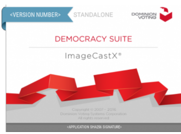
Figure 9-1: Startup screen