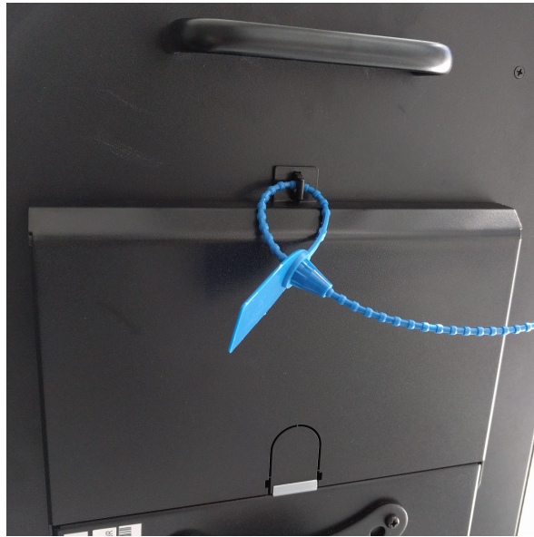
Figure A-3: Top Avalue security latch seal