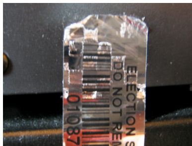
Figure A-2: Evidence of Tampering: Peeled and Reapplied