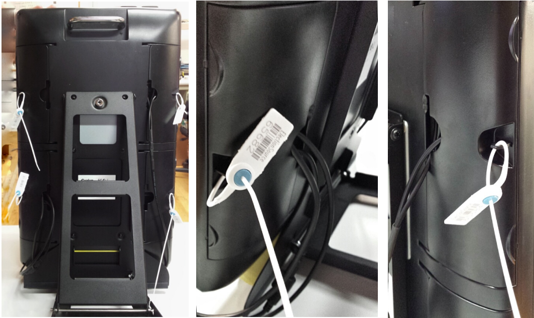
Figure A-5: ImageCast ® X Prime security seals

The images below show how the plastic seals should look when used on the ImageCast ® X Prime device.