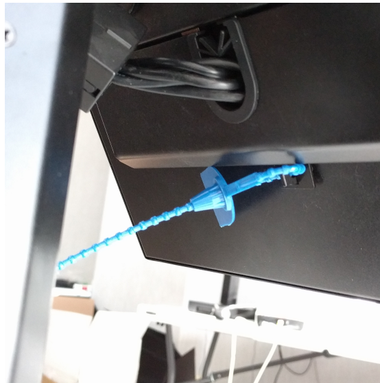
Figure A-4: Bottom Avalue security latch seal