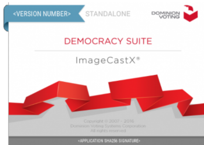
Figure 9-1: Startup screen