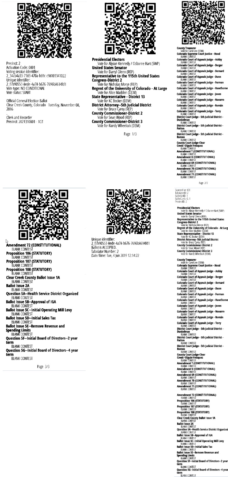
Figure 4-1: Scanned VVPAT audit trail